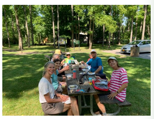
Fishers Park @ Main St. Fishers