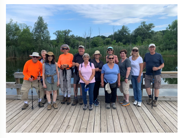
Victor Municipal Park Fishing Dock

Looking for a mid-week morning walk? Come to the library at 15 West Main Street in Victor at 9:15 AM on a Wednesday and join a small group of hikers. The distance is usually 2-3 miles at an easy pace. The location is usually in Victor or one of several parks close by. The group usually convenes at a local restaurant for coffee or more. Here are a few pictures of the group at various locations.