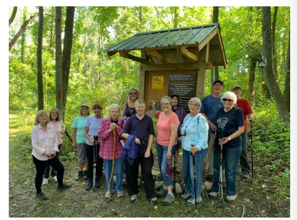
Helen's Way @ the kiosk