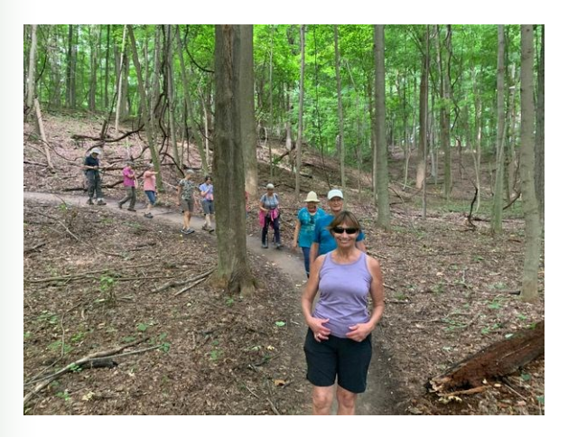
Dryer Road Park, in the woods